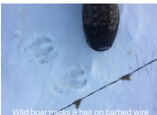
Wild boar tracks & hair on barbed wire