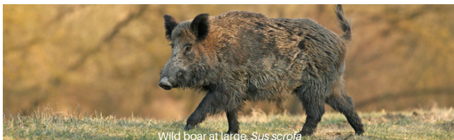
Wild boar at large, Sus scrofa